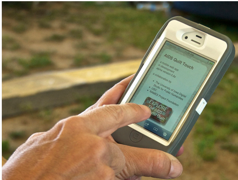
Fig. 6. AIDS Quilt Touch mobile web app launches.