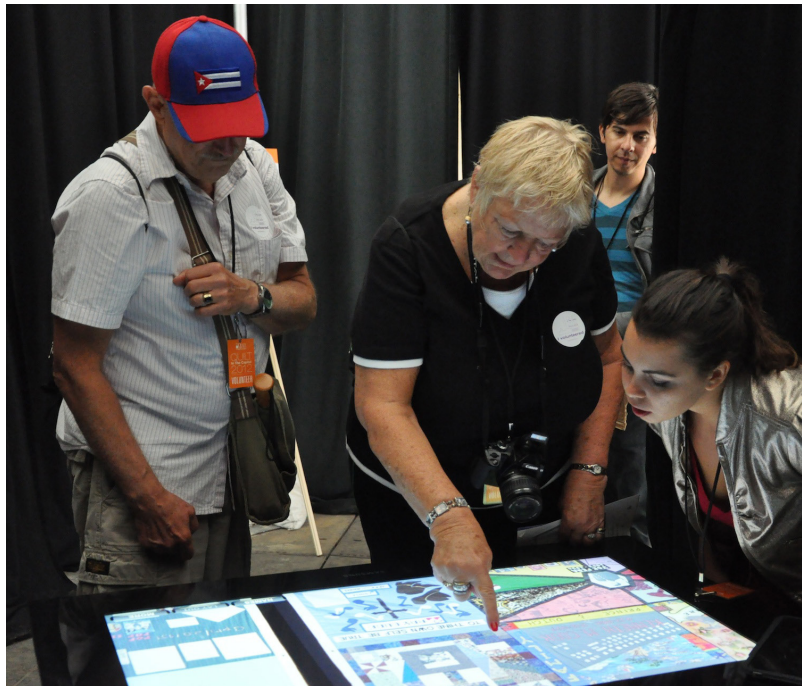
Fig. 3. Image of visitors using the AQT Virtual Quilt Browser.

3. In the early 2000s, Balsamo and MacDonald, with colleagues at Xerox PARC, were involved in research efforts to develop the Tilty Table, an interactive museum exhibit created as part of “XFR: eXperiments in the Future of Reading.” This work represented a significant step towards the development of the AQT: Virtual Browser. For a description of the creation of the XFR exhibit, see: Balsamo, Designing Culture: The Technological Imagination at Work . Duke University Press, 2011. Other research that supports the observation that horizontal displays enables collaboration include: Rogers and Rodden, 2004; Mazalek, et. al., 2009.