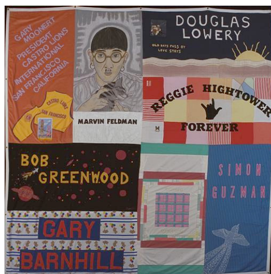
Fig. 2. Eight panels that became the first block of the AIDS Quilt.

The first experience focuses on one of the most compelling aspects of the Quilt: its spatial expansiveness. The AQT: Virtual Quilt Browser is an interactive browser that enables visitors to view, zoom, and pan across a collection of digital images of 48,000 Quilt panels displayed on a multi-touch table display. Collaboration with the Computer Visualization Research Team (led by Andy Van Dam) at Brown University resulted in the creation of a customized gesture-based interactive mode optimized for a large-surface multi-touch table display. 2