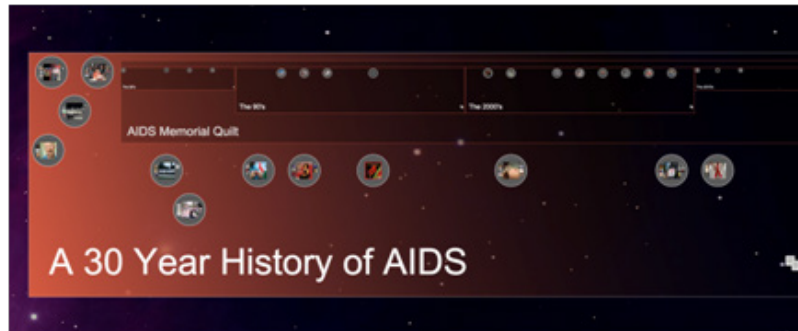
Fig. 5. Screenshot of the AIDS Quilt Touch Timeline created in ChronoZoom.

The AQT: Timeline was designed to inspire people to engage in conversations about the broader social, political, and bio-medical events that are part of the multi-faceted history of AIDS and the Quilt in the U.S. In creating interactive content, we took account of the cultural critiques of the way in which AIDS and the understanding of HIV have been narrativized in the “official histories” of the epidemic. Many scholars and activists contest these histories for the pejorative bias that sneaks into descriptions and accounts. For example, the persistent reference to people who are infected with HIV as “AIDS victims” propagates identities that are not consonant with those promoted by activists and people living with HIV. The term “victim” implies a state of powerlessness. Drawing on the history of AIDS activism, this application presents key episodes that highlighted critical acts of social intervention—when, for example, activists confronted government officials and protested official policies. The interactive makes it possible to present multiple histories—both those that serve as official accounts and those that serve as counter-narratives.